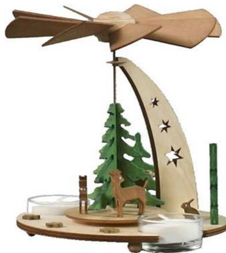
Figure 1 Candlesticks «New Year's pyramid»

The analysis of variants of articles-analogs of candlesticks and combination of the best features of the chosen variant of construction allows to offer the final variant. This design object combines scientific, technical and artistic aspects, allowing the artist to realize his or her own creative potential.