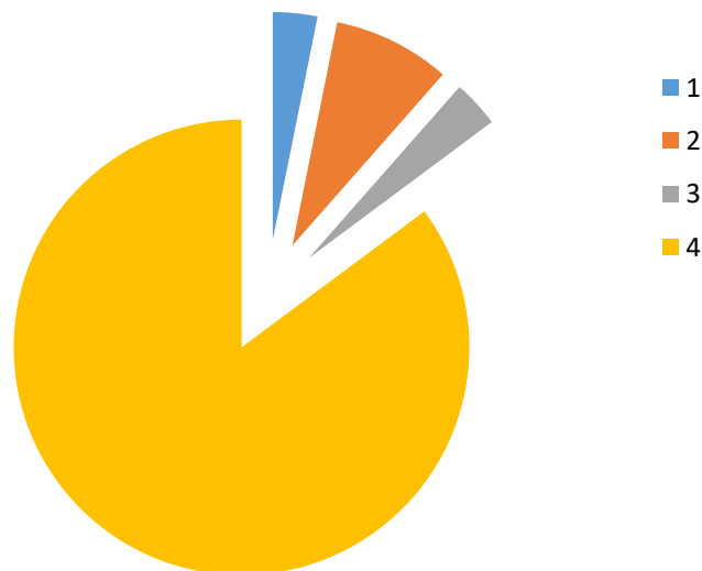
Figure 1 - The average composition solid waste of the clinic: 1– safewaste (A); 2– potentially infected waste (B); 3– toxicologically hazardous medical waste (C); 4– other wastes.

The general structure of all types of waste generated daily in the studied dental clinic is presented in Fig.1.